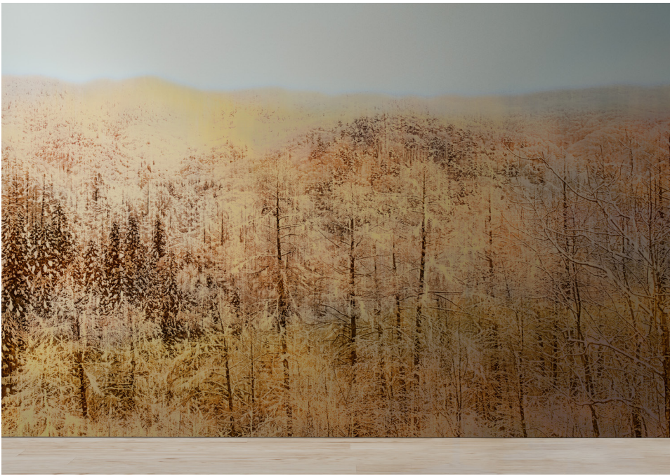
AB Concept x Calico Wallpaper