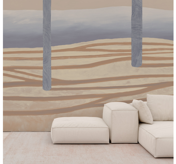
Kelly Behun x Calico Wallpaper