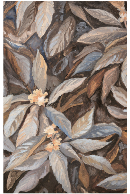
Simona Meraviglia for WallPepper