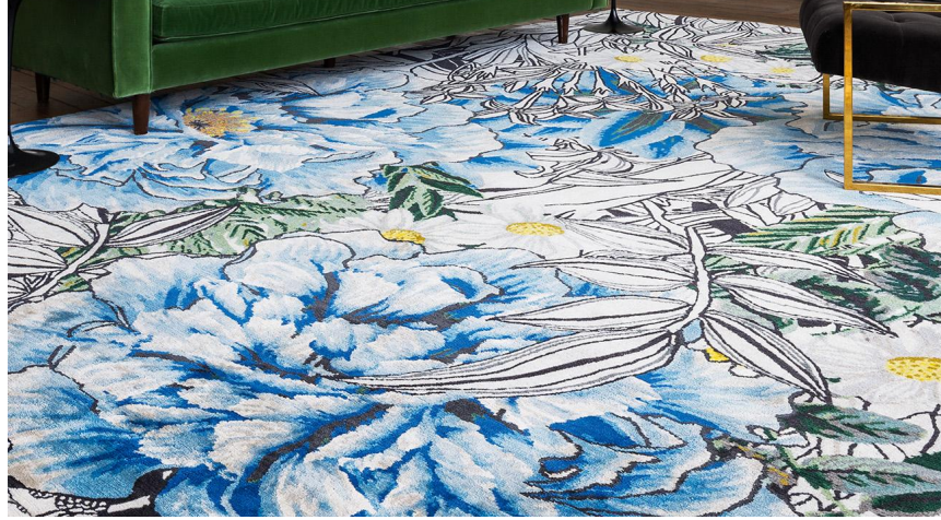
Fantastic floral carpet designed by Mary Katrantzou for the Rug Company. Garden of Eden, handknotted in wool and silk, 183cm x 122cm, £4,688, therugcompany.com