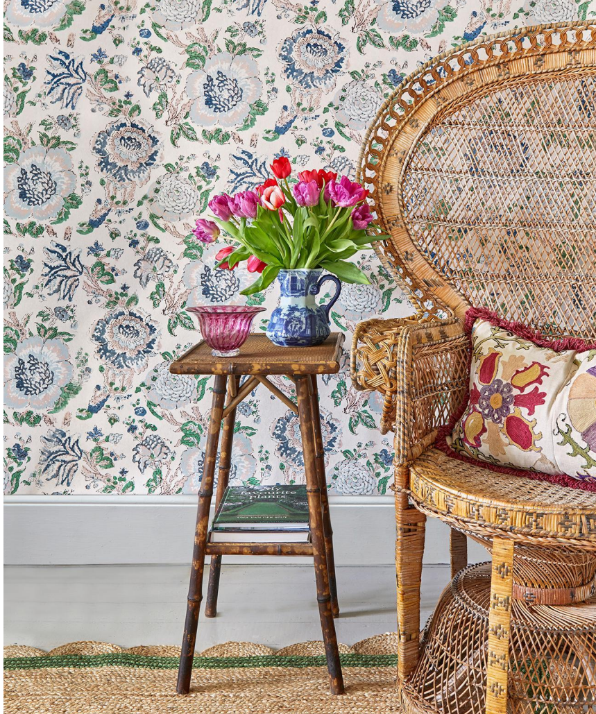
Sarah Vanrenen's Dahlia wallpaper has a floral pattern inspired by traditional block prints, coloured in a contemporary palette. Shown in Blue, £74 a metre, thefabriccollective.com