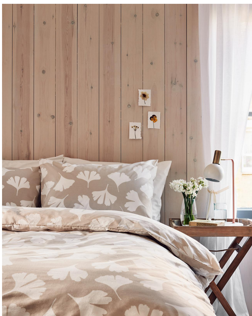
Botanical designs don't have to be green. This ginkgo bedding set features white leaves on a nude background. Polycotton double duvet