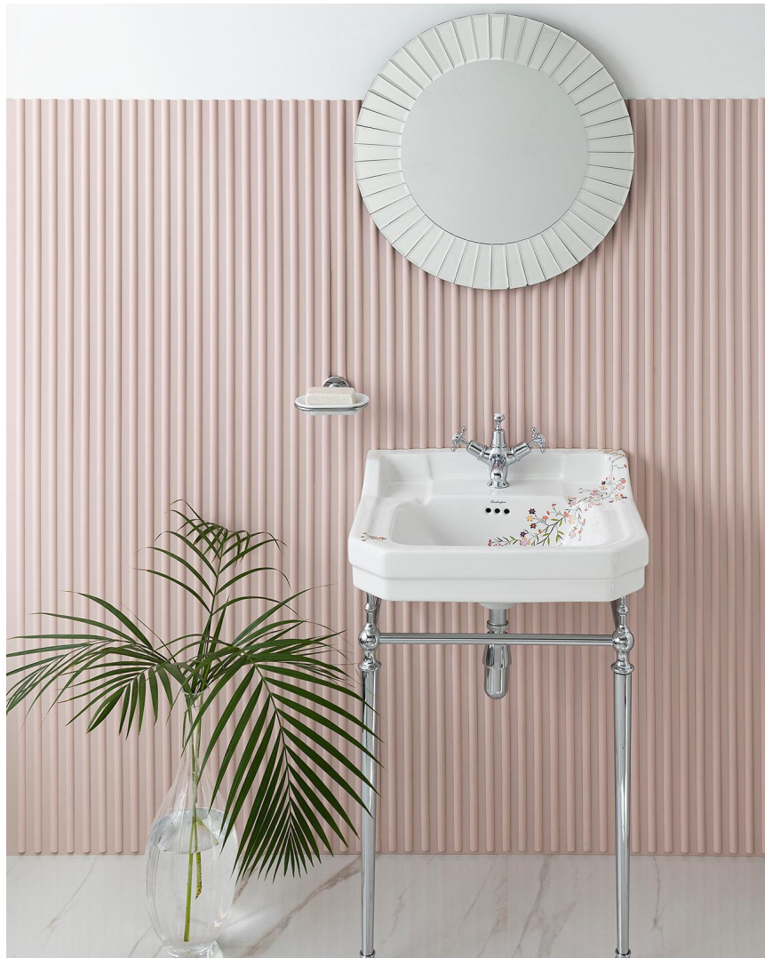
New botanicals for the bathroom. The Bespoke by Burlington collection, launching in July, is hand-decorated with lithographs of blossom designed by the illustrator Julie Ingham. From £399 for a decorated 51cm Edwardian cloakroom basin, burlingtonbathrooms.com